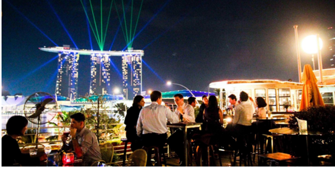
The Rooftop Private Corner

The venue fee and F&B minimum spending will depend on the number of guests.